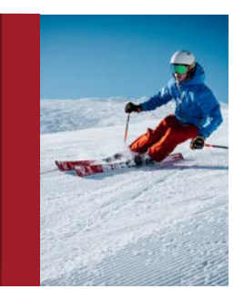
Exhibit Hours 9:00 am - 4:00 pm